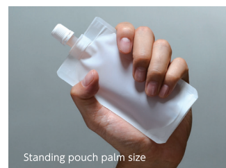
Standing pouch palm size