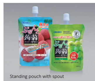
Standing pouch with spout

With a small footprint, bags with easy-to-use spouts are made and filled. Various spout can be selected. An optional splicer can also be installed.